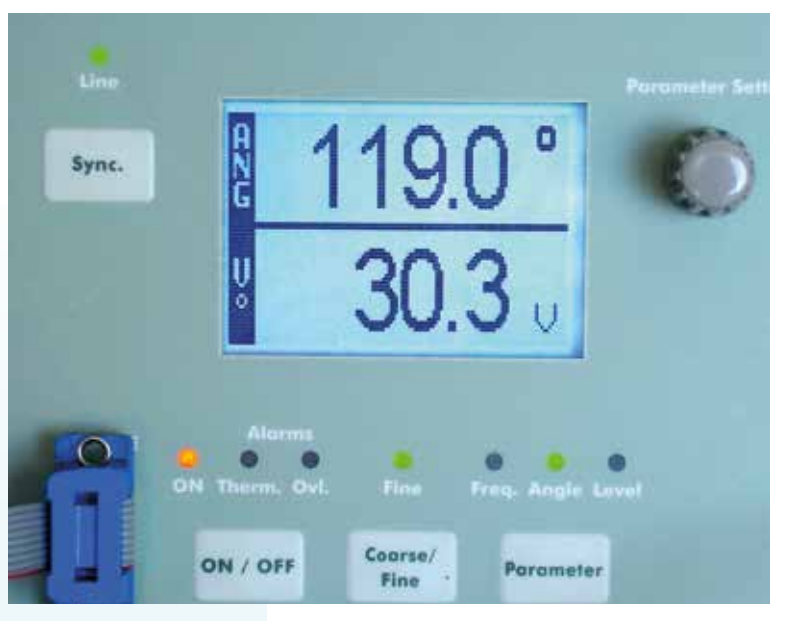
The PTE-100-C Pro's independent voltage module provides the necessary voltage injection for direccional relays and generador or motor protections. This module can also be purchased separately and installed in the PTE-100-C's lid in a few minutes.